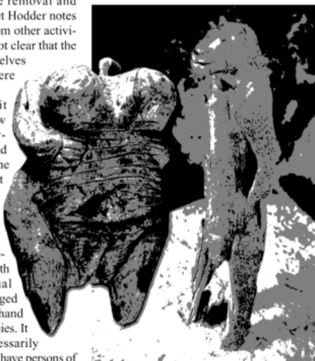
Signs of the spirit? Small, 30,000-year-old figurines from Germany suggest religious belief.