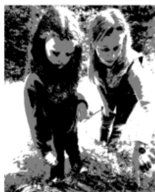
Who made it? Studies suggest that children tend toward creationist explanations of natural phenomena.

Other researchers are extending this cognitive model, finding additional thought processes that they say make religious belief natural. For example, Bloom and Jesse