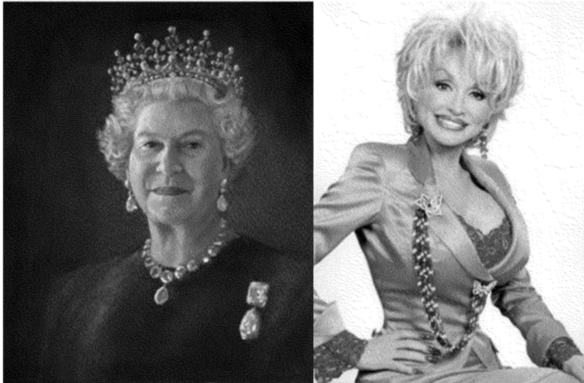
Queen Elizabeth and Dolly Parton