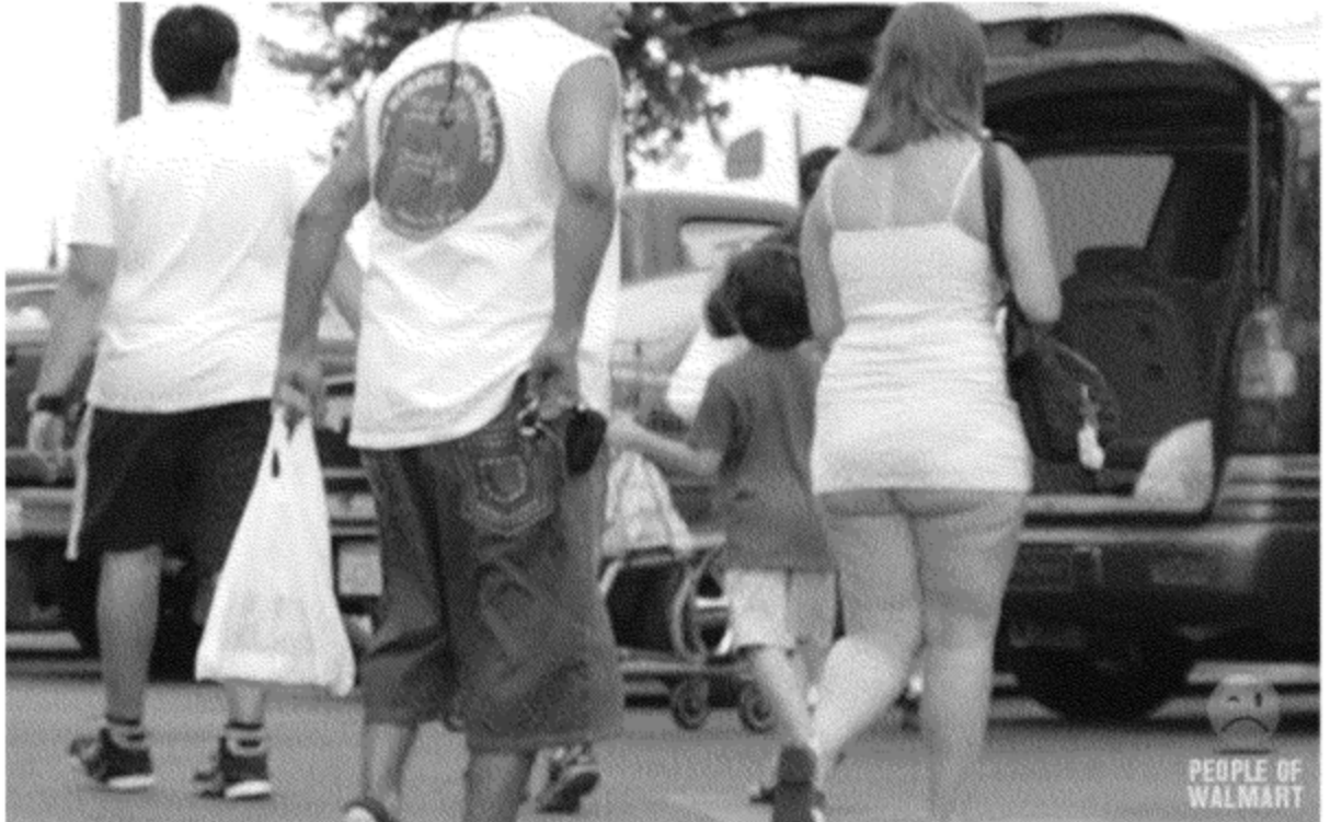
Its not her fault; that guy's fabulous rat tail makes all the girls pull their skirts up. California