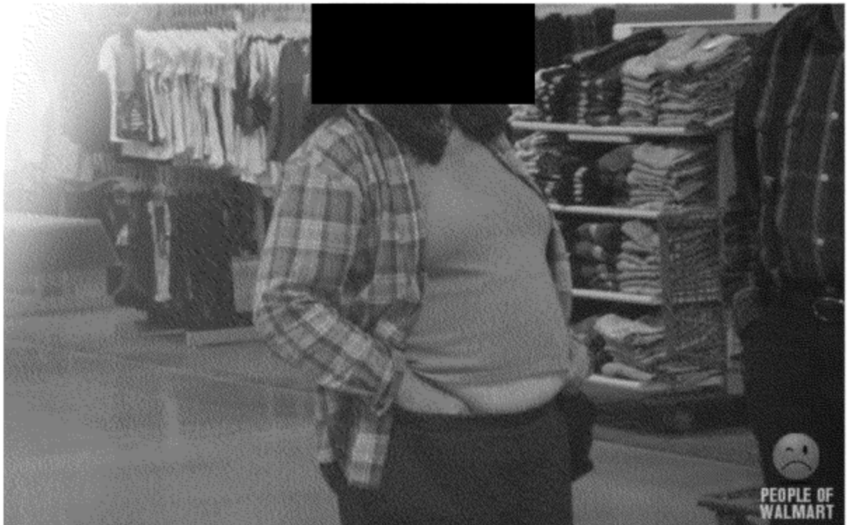
I've got 4 to 1 odds saying she smelled her hand after she pulled it back out.