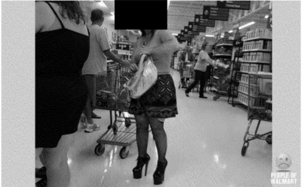
This lady looks like she woke up in an alley somewhere in Mexico and had the urge to get to a Walmart immediatamente. South Carolina